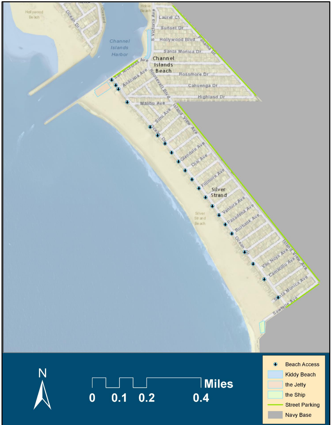
Figure 2. Legal Public Parking on Silverstrand Beach, Oxnard CA